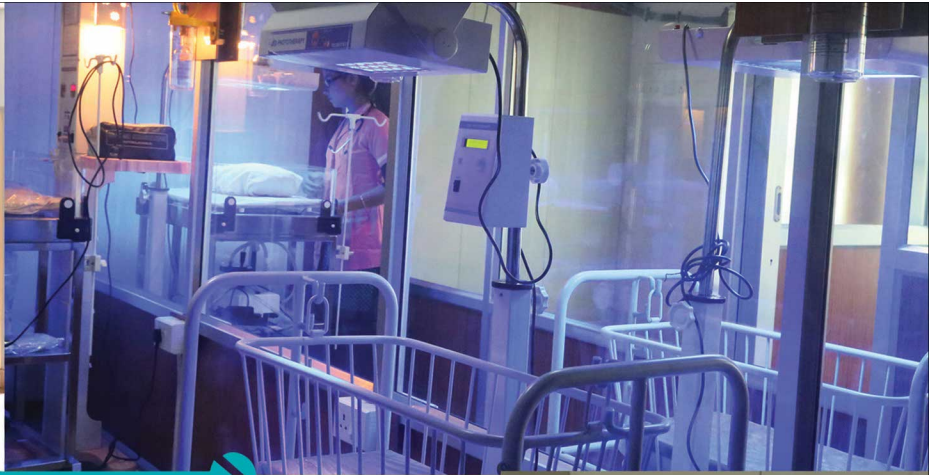
Neonatal Intensive Care Unit