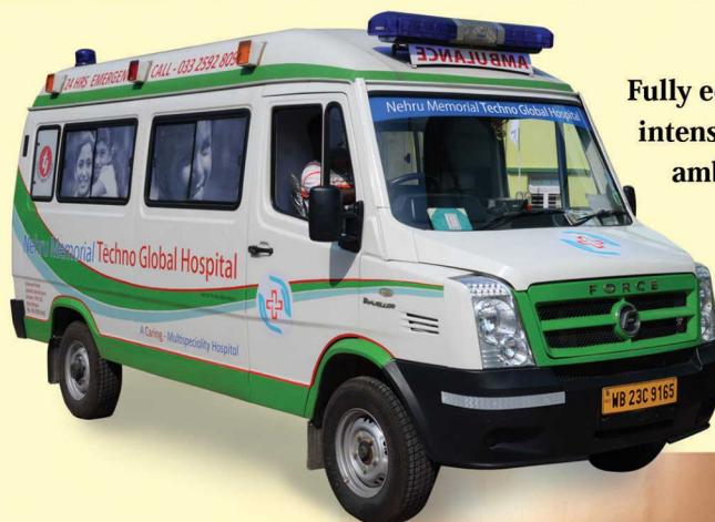
Fully equipped intensive care ambulance.