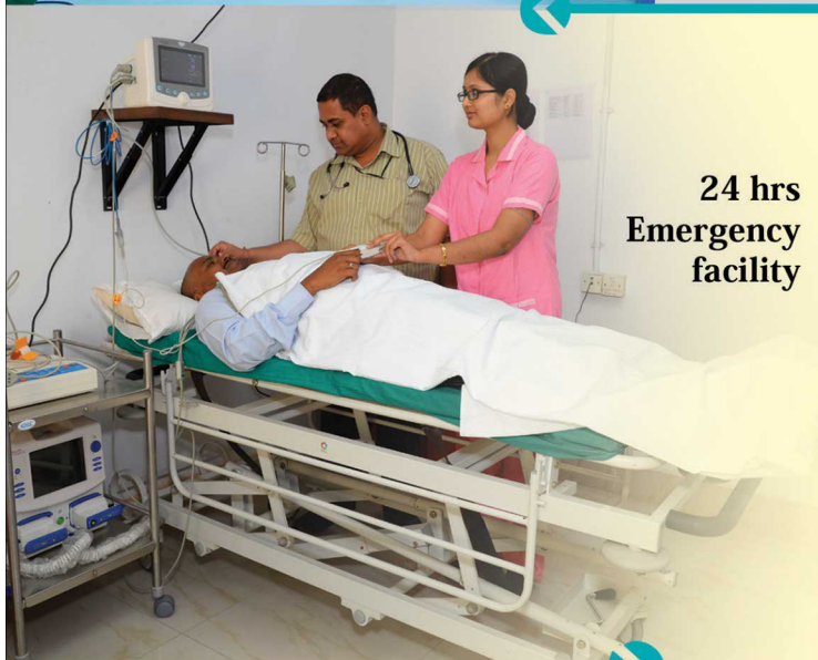
24 hrs Emergency facility