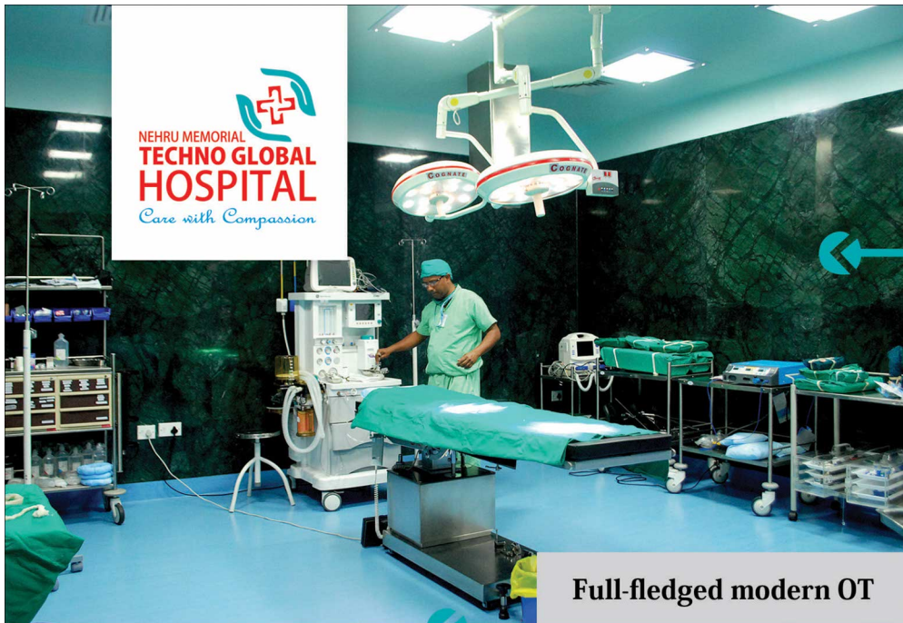
Full-fledged modern OT